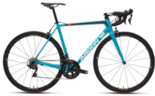
TEAL BLUE MATTE