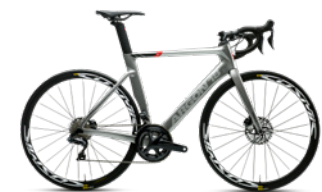
COOL GREY GLOSS

The Nitrogen Disc answers the call of those dreaming of the one bike that will rule them all. It will let them race criteriums, the occasional triathlon or simply get out there on a super fast stylish bike.